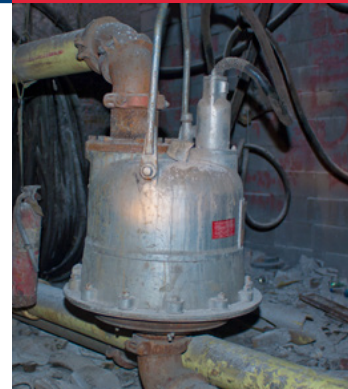
In-line staged submersible pump increases pumping distance.