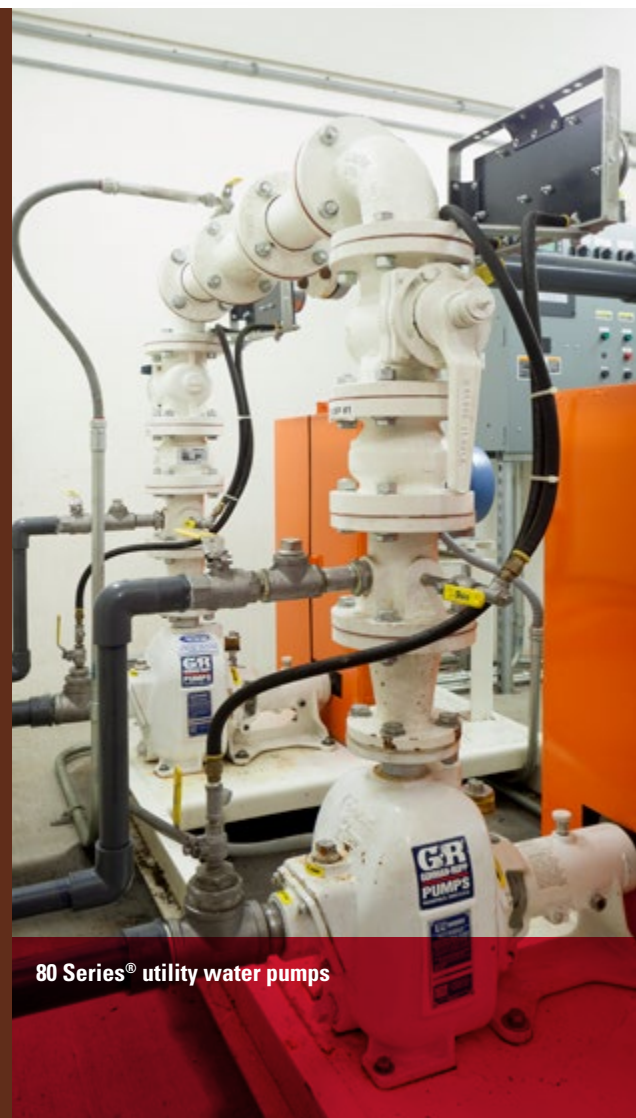
80 Series® utility water pumps

NOTE: Gorman-Rupp recognizes that the above treatment plant diagram will not apply for all municipalities and is meant for illustrative purposes only.