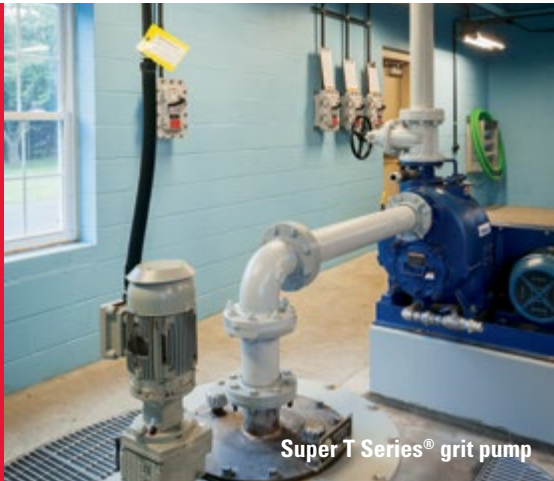
Super T Series® grit pump