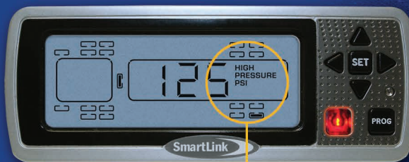
High Pressure Warning