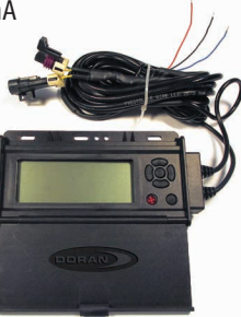
Monitor for RS-232, J1939, J1708 data output