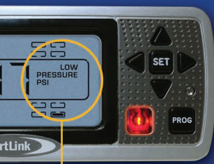
Low Pressure Warning