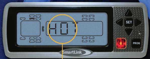
High Temperature Warning