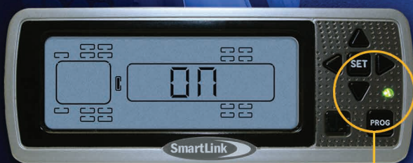
Green Means Good™