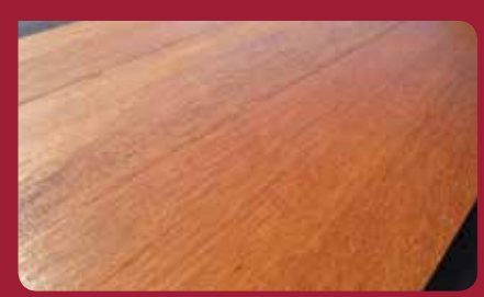
Apitong flooring – proven performance and durability ensures a solid base for any load.