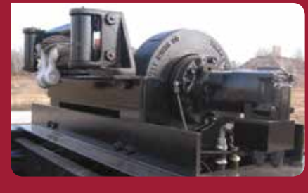
Heavy-duty planetary winch, standard with Talbert, is operated by a wireless remote control, delivering maximum pulling power.