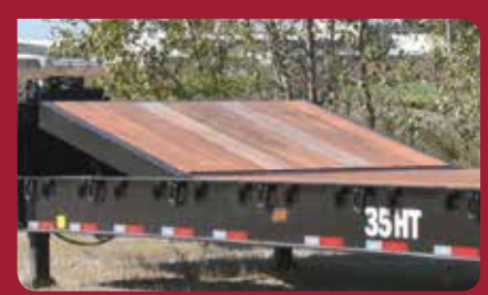
The hydraulic front ramp offers a convenient method for gooseneck loading.