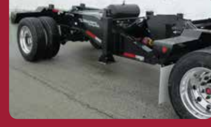
Allows users to operate as a 3+1 spread-axle with the E1Nitro™. Can also function as four axle close coupled.