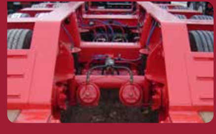
Unique bucket well / boom well configuration provides lowest excavator transport height in the industry.