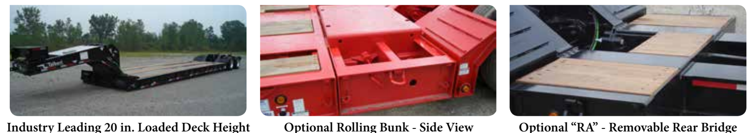
Optional "RA" - Removable Rear Bridge