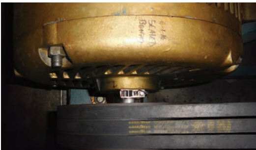
BPK-4 on Air Handling Unit Fan Motor

The Helwig Carbon Products Bearing Protection Kits (BPK) performed exceptionally well and virtually eliminated the high percentage of motor failure rates.