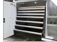
ADDITIONAL MECHANIC DRAWERS