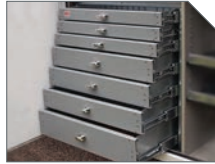
STEEL MECHANIC DRAWERS