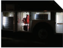
LED COMPARTMENT LIGHTS