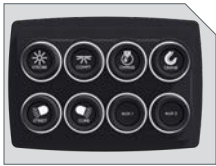
8x BUTTON KEYPAD