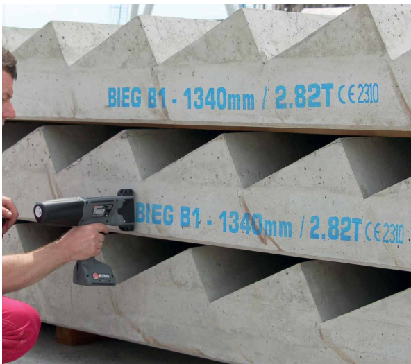
Also prints on concrete with blue pigmented ink