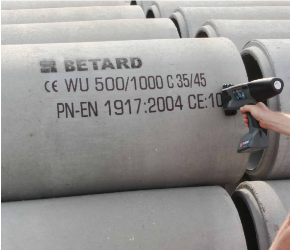
Prints on concrete with special UV-resistant black ink