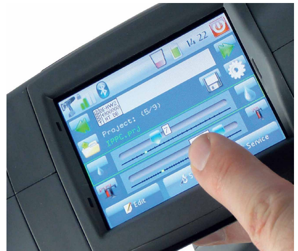
Control and input via touchscreen

For more information on the reimagined HandJet EBS-260, contact EBS Ink-Jet Systems at 847-996-0739 or america@ebs-inkjet.com .