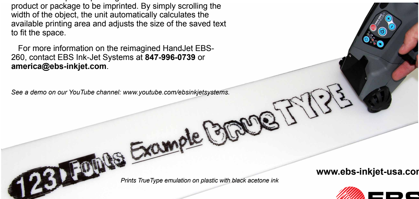
Prints TrueType emulation on plastic with black acetone ink

See a demo on our YouTube channel: www.youtube.com/ebsinkjetsystems .