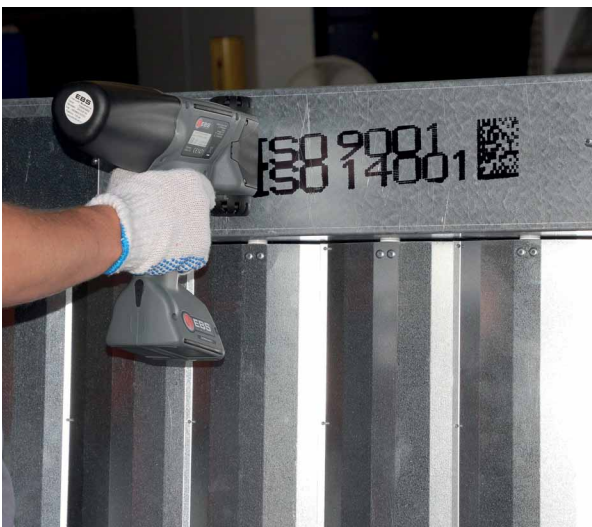
Prints on steel with black universal ink

EBS Ink-Jet revolutionized hand-held coding when we introduced the HandJet EBS-250. Now our next-generation HandJet EBS-260 model provides reimagined features and functionality for even more innovative, portable coding.