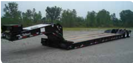
Industry Leading 20 in. Loaded Deck Height

Various Options Available Upon Request. Specifications Subject To Change Without Notice.