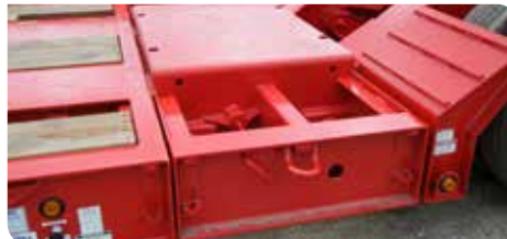
Optional Rolling Bunk - Side View