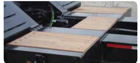
Optional "RA" - Removable Rear Bridge